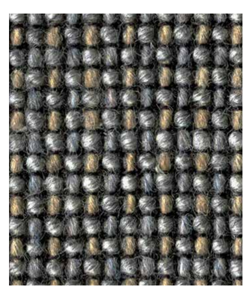
Craggan Flax Gravel CRA08