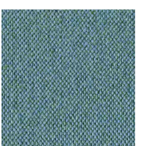
Main Line Flax Bethnal MLF25