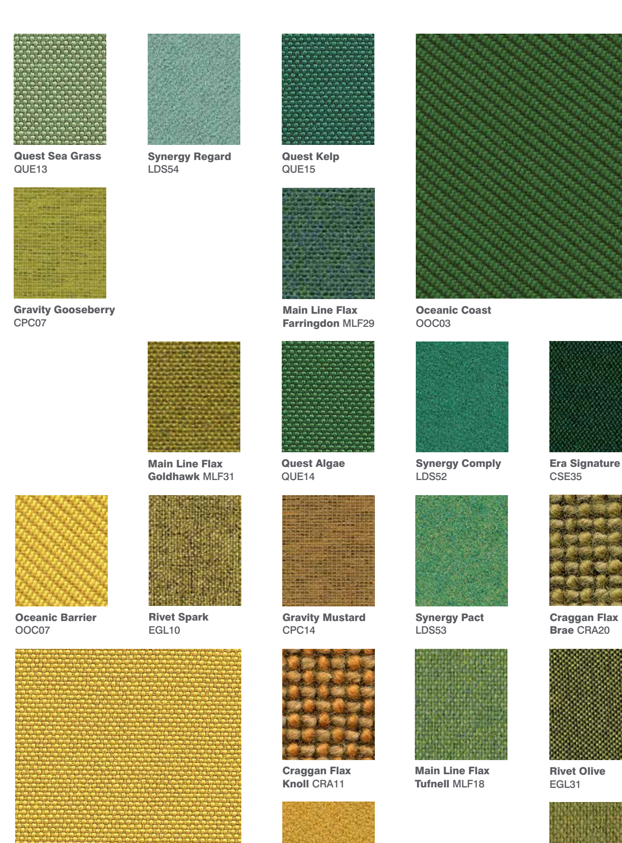
Quest Sandstone QUE20