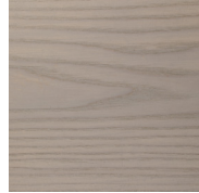
Gray Over Ash WGA