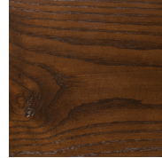
Walnut Over Ash WWA