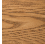
Oak Over Ash WOA