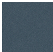
Smokey Blue 4179 FSB