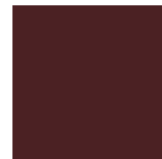
Burgundy 4154 FBU