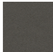
Iron 4178 FIR