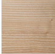
Clear Over Ash WCA